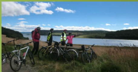
Cycling in Rural Scotland - 22 nd Mar 2014