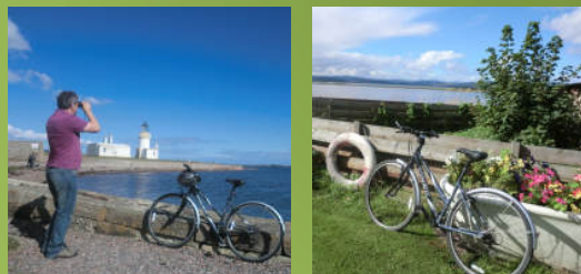
Cycling in Rural Scotland - 22 nd Mar 2014